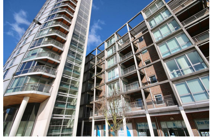
6TH FLOOR 720 sq.ft. (66.9 sq.m.) approx.